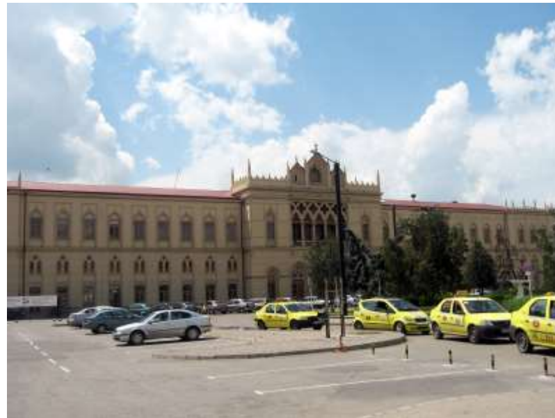
The Great Railway Station