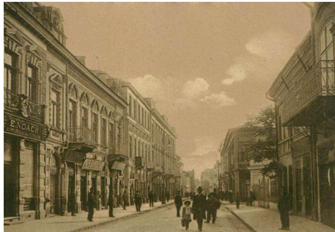
Old image of Lăpuşneanu Street