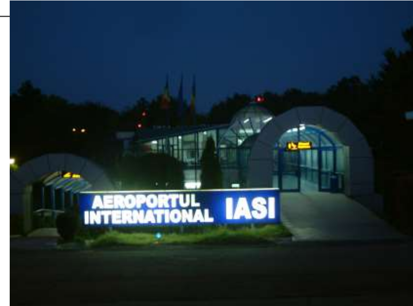
Iasi International Airport