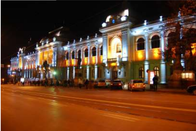
"Alexandru Ioan Cuza" University

The city of Iasi is one of the largest cities of Romania, which is demonstrated both by its surface, the number of inhabitants but also due to the opportunities offered. Iasi has the oldest university in the country "Alexandru Ioan Cuza", one of the most spectacular train stations, but also an international airport.