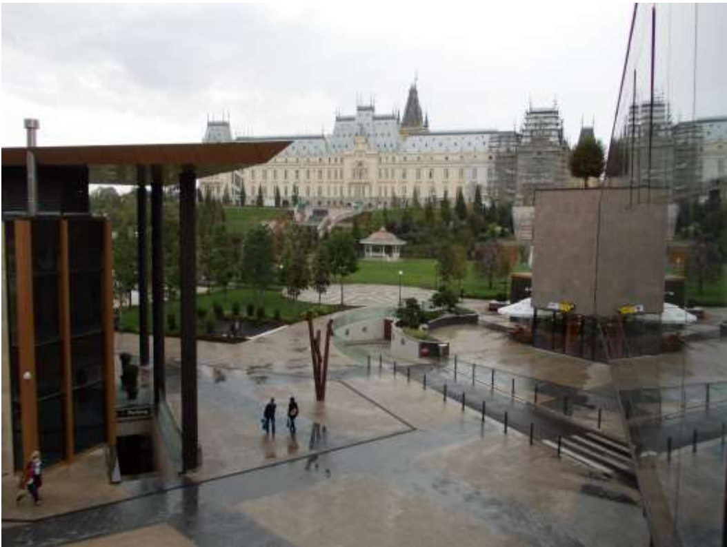
Iasi, panorama to Palas Shopping Center and Palace of Culture