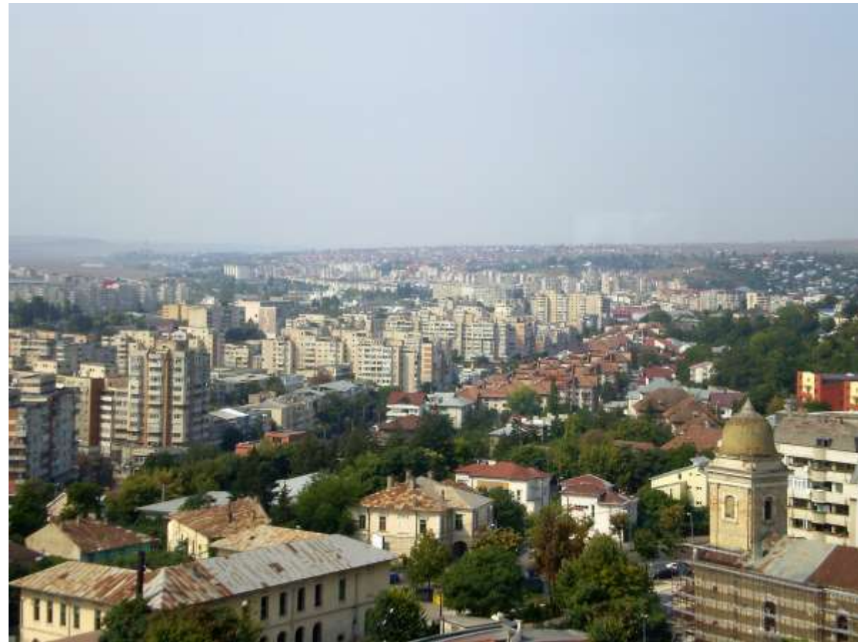
Iasi, panorama to some of the neighborhoods