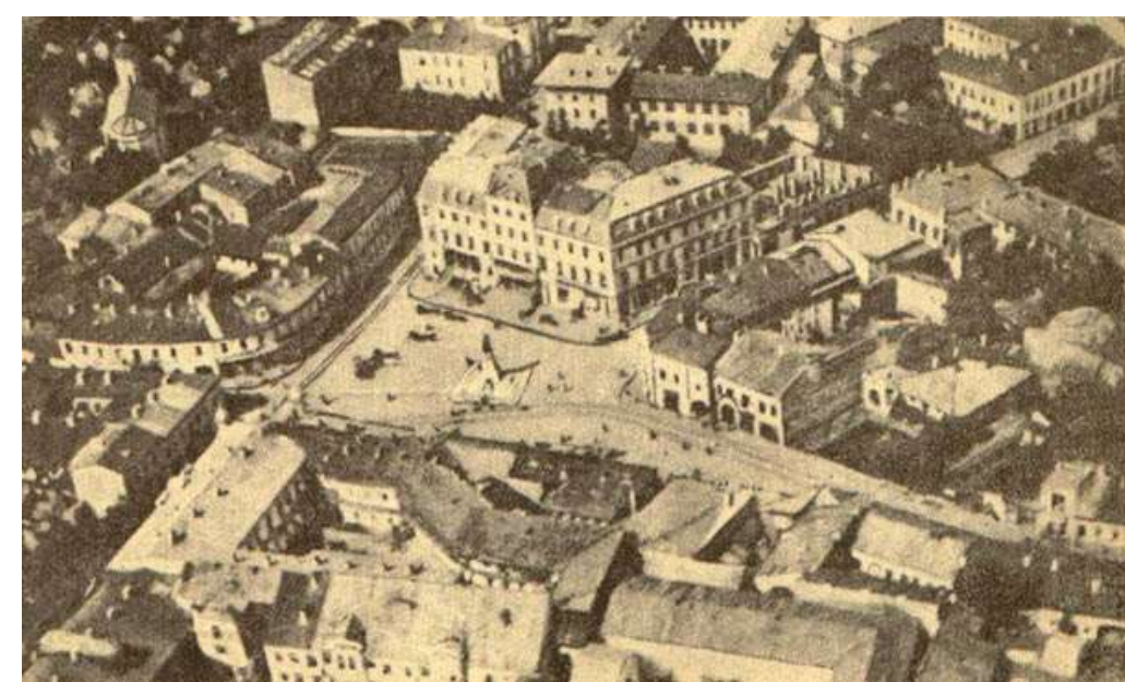
Old aerial view of the city center (Unirii Square area)